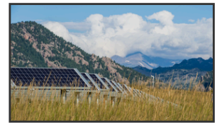
"Never doubt that a small group of committed citizens can change the world. Indeed, it is the only thing that ever has." —Margaret Mead, Anthropologist

I RECENTLY IMPLEMENTED A NEW, MOBILE FRIENDLY SITE DESIGN. I ADD ALL PHOTOS, WRITE AND EDIT COPY, PUBLICIZE EVENTS, AND ADD VIDEO CONTENT TO WISE.WILDAPRICOT.ORG. ALSO SEND EMAIL BLASTS FROM THIS CMS SITE. OTHER BOARD MEMBERS SEND CONTENT THAT I EDIT FOR STYLE AND CONTENT.